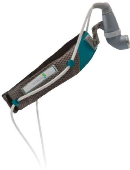
UltraLite Plus Sweatband